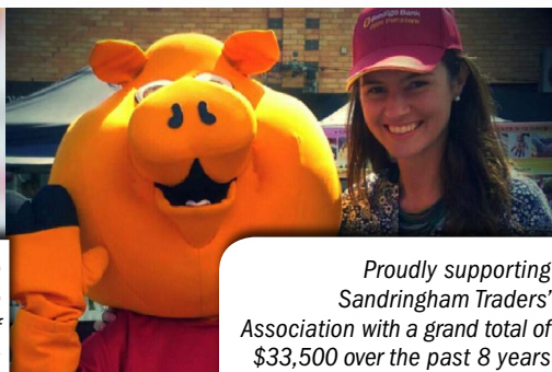
Proudly supporting Sandringham Traders' Association with a grand total of $33,500 over the past 8 years