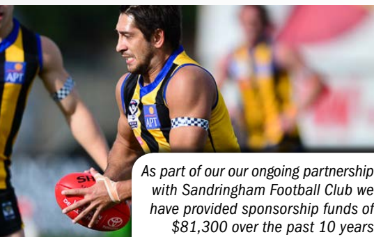
As part of our ongoing partnership with Sandringham Football Club we have provided sponsorship funds of $81,300 over the past 10 years