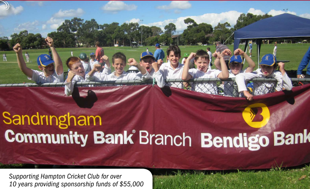
Supporting Hampton Cricket Club for over 10 years providing sponsorship funds of $55,000